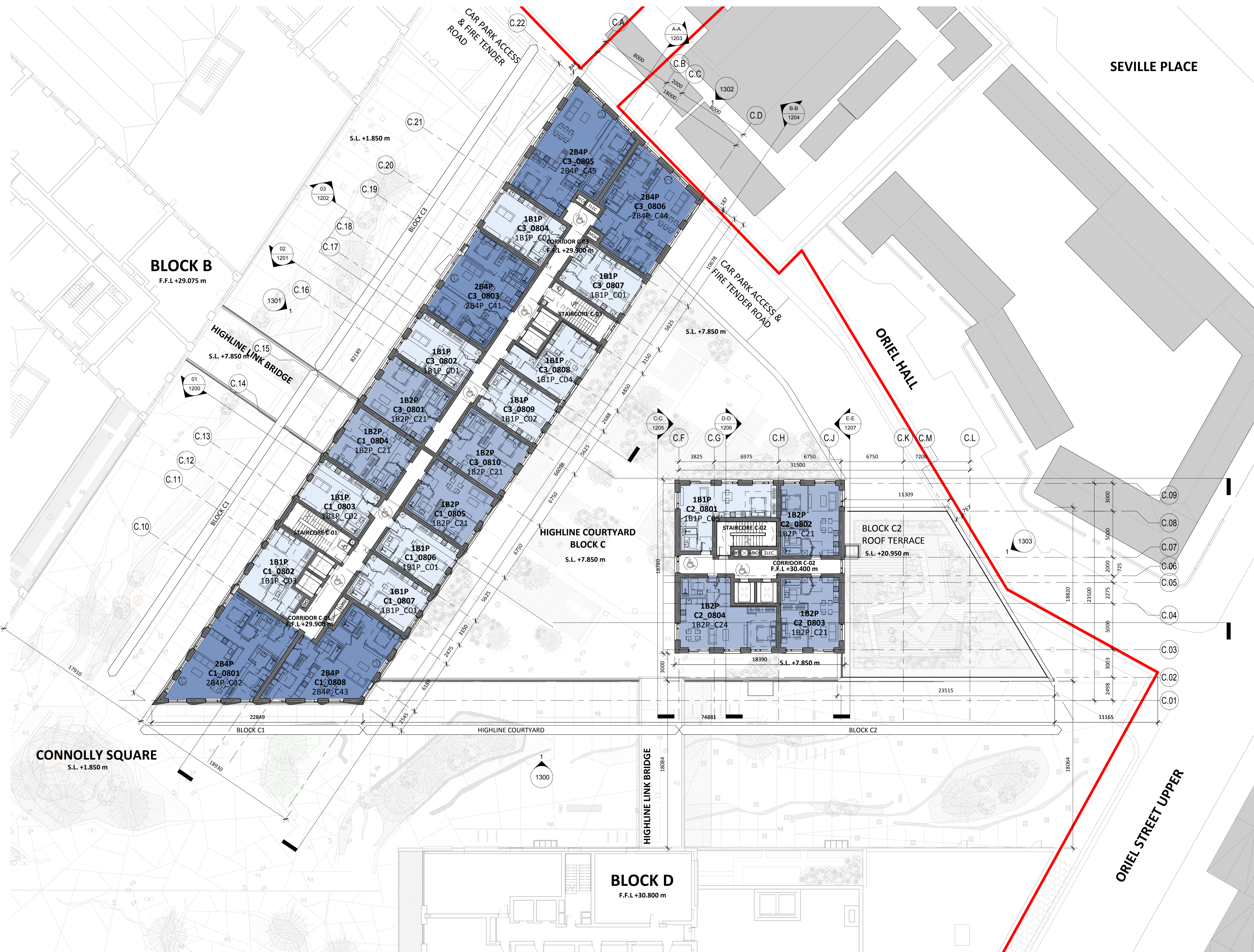
1 BLOCK C PLAN_LEVEL 08 1 : 200